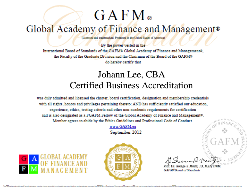
Figure 2 – Sample Certification and Fellowship declaration

The GAFM ® Quality Certification Documents can be displayed in plain view either mounted separately or together. The Certification, Membership & fellowship certification can only be displayed if you are in Good Standing with the Academy and you are recorded on the GAFM member register as a current member.