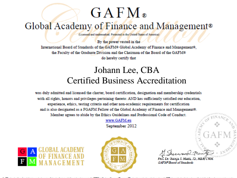
Figure 2 – Sample Certification and Fellowship declaration

The GAFM® Quality Certification Documents can be displayed in plain view either mounted separately or together. The Certification, Membership & fellowship certification can only be displayed if you are in Good Standing with the Academy and you are recorded on the GAFM® member register as a current member.